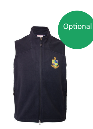
Polar Fleece Vest