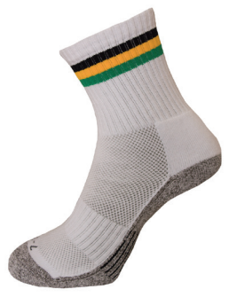
Sports Sock 2pk